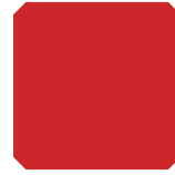
134 OC/LC Rosso Red Rojo