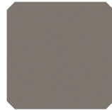
130 OC/LC Grigio Piacenza Piacenza grey Gris Piacenza