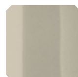
350 VTR LC Canapa Hemp Cáñamo