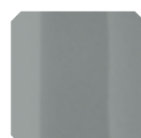
352 VTR LC Pomice Pumice Pómez