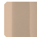
357 VTR LC Pesca Peach Melocotón