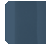
354 VTR LC Blu avio Airforce blue Azul cielo