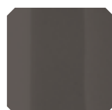
328 VTR LC Smoke Smoke Smoke