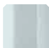
320 Trasparente Transparent Transparente

Only where applicable Solo en los casos previstos