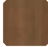
LGN NC Noce Canaletto Canaletto walnut Nogal negro