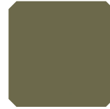
153 OC/LC Verde muschio Moss green Verde musgo