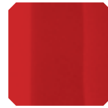
334 VTR LC Rosso Red Rojo