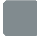
155 OC/LC Carta da zucchero Soft grey Azul niño