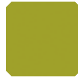
147 OC/LC Oliva Olive Oliva