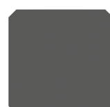
363 Fumé Smoked Fumé