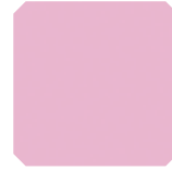
145 OC/LC Rosa Pink Color de rosa