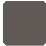
128 OC/LC Smoke Smoke Smoke