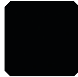
131 OC/LC Nero fumo Smoky black Negro humo