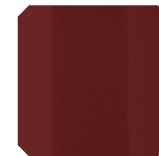
356 VTR LC Bordeaux Burgundy Burdeos