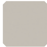
124 OC/LC Madreperla Mother of pearl Madreperla