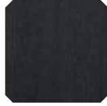
LGN RC Rovere carbone Coal oak Roble carbón