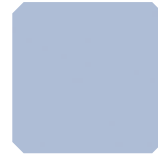
142 OC/LC Celeste Light blue Celeste