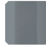
355 VTR LC Carta da zucchero Powder blue Azul niño