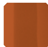
348 VTR LC Arancio Orange Naranja