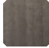
LGN RS Rovere Siena Siena oak Roble Siena