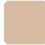
157 OC/LC Pesca Peach Melocotón