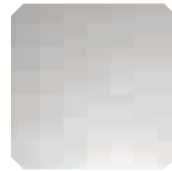
383 Specchio grigio Grey mirror Espejo gris