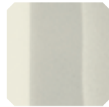
322 VTR LC Panna Cream Nata