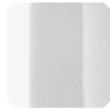
321 VTR LC Bianco gesso Chalk white Blanco yeso