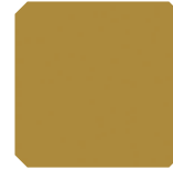
158 OC/LC Zafferano Saffron Azafrán