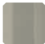
327 VTR LC Hot Hot grey Hot