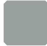
152 OC/LC Pomice Pumice Pómez