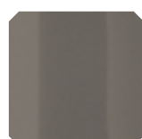
330 VTR LC Grigio Piacenza Piacenza grey Gris Piacenza