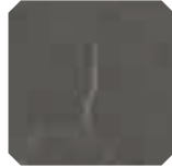
HPL scuro Dark HPL HPL oscuro