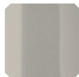
324 VTR LC Madreperla Mother of pearl Madreperla