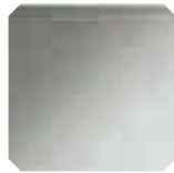
381 Specchio argentato Silver mirror Espejo plateado