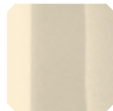
323 VTR LC Avorio Ivory Marfil