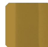
358 VTR LC Zafferano Saffron Azafrán