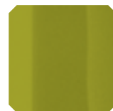
347 VTR LC Oliva Olive Oliva