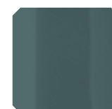
359 VTR LC Salvia Sage Salvia