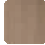
LGN RN Rovere naturale Natural oak Roble natural