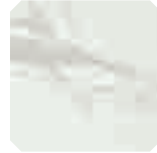
HPL chiaro Light HPL HPL claro