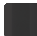
360 VTR LC Antracite Anthracite Antracita