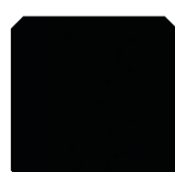
331 VTR LC Nero fumo Carbon black Negro humo