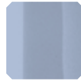
342 VTR LC Celeste Light blue Celeste