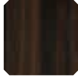
LGN RT Rovere termocotto Heat-treated oak Roble termotratado