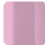
345 VTR LC Rosa Pink Color de rosa