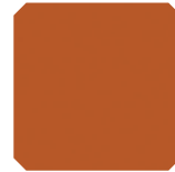
148 OC/LC Arancio Orange Naranja