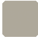
127 OC/LC Hot Hot grey Hot