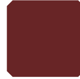
156 OC/LC Bordeaux Burgundy Burdeos