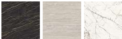
KM07 matt Portoro