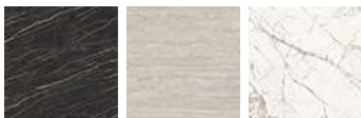
KM07 matt Portoro