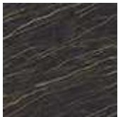
KM07 matt Portoro