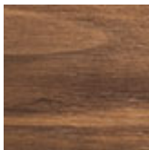
NC walnut canaletto